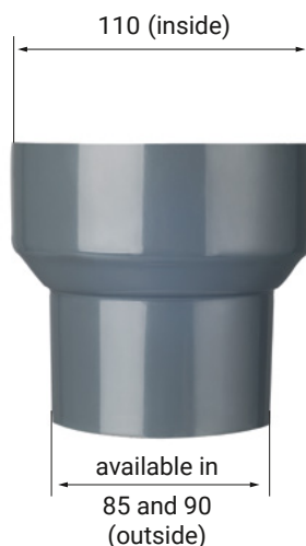
Plumbing pipe adapter DN 90 and DN 100