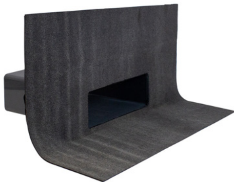
Flange collar made of bituminous membrane